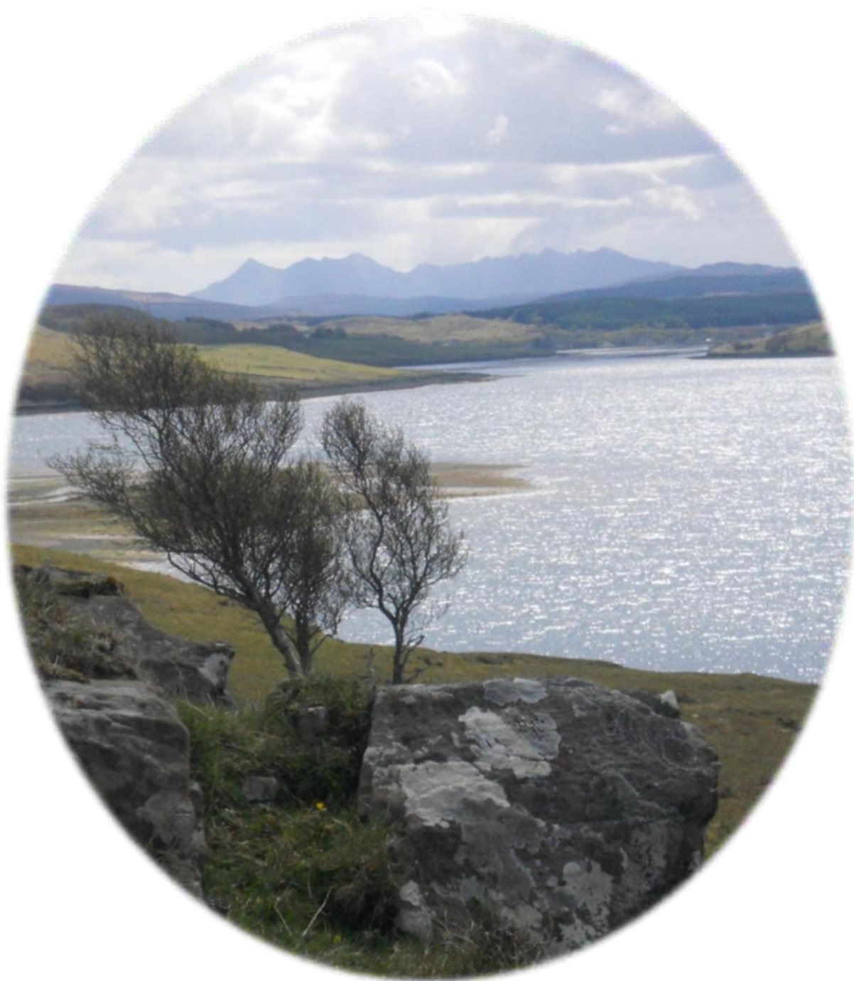
Loch Snizort Beag with the Cuillin Hills