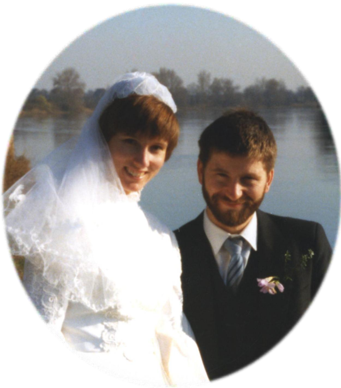
By the River Elbe in Pillnitz near Dresden on our wedding day, 23 rd February 1990