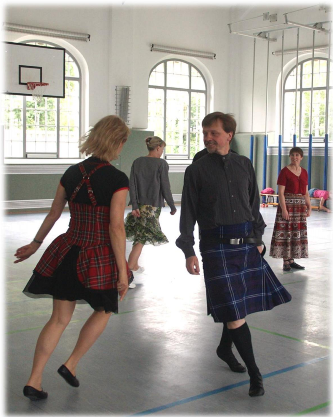
Dancing in Freiberg on 21 st June 2014