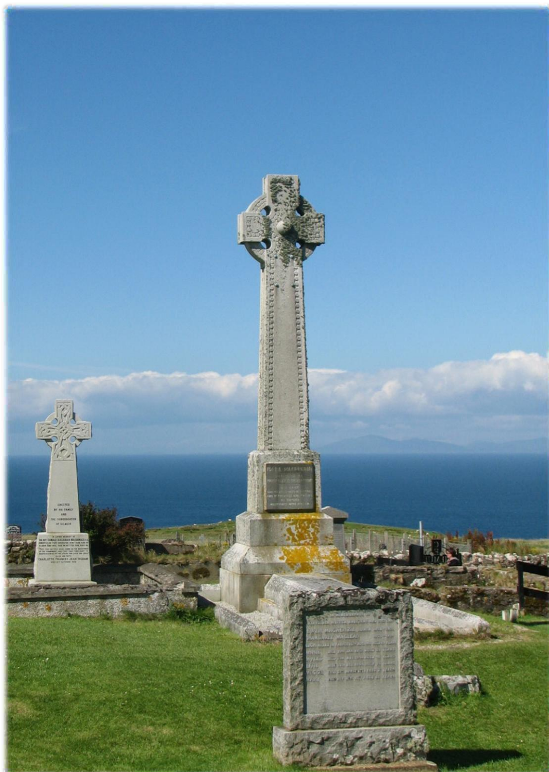
Flora MacDonald's monument