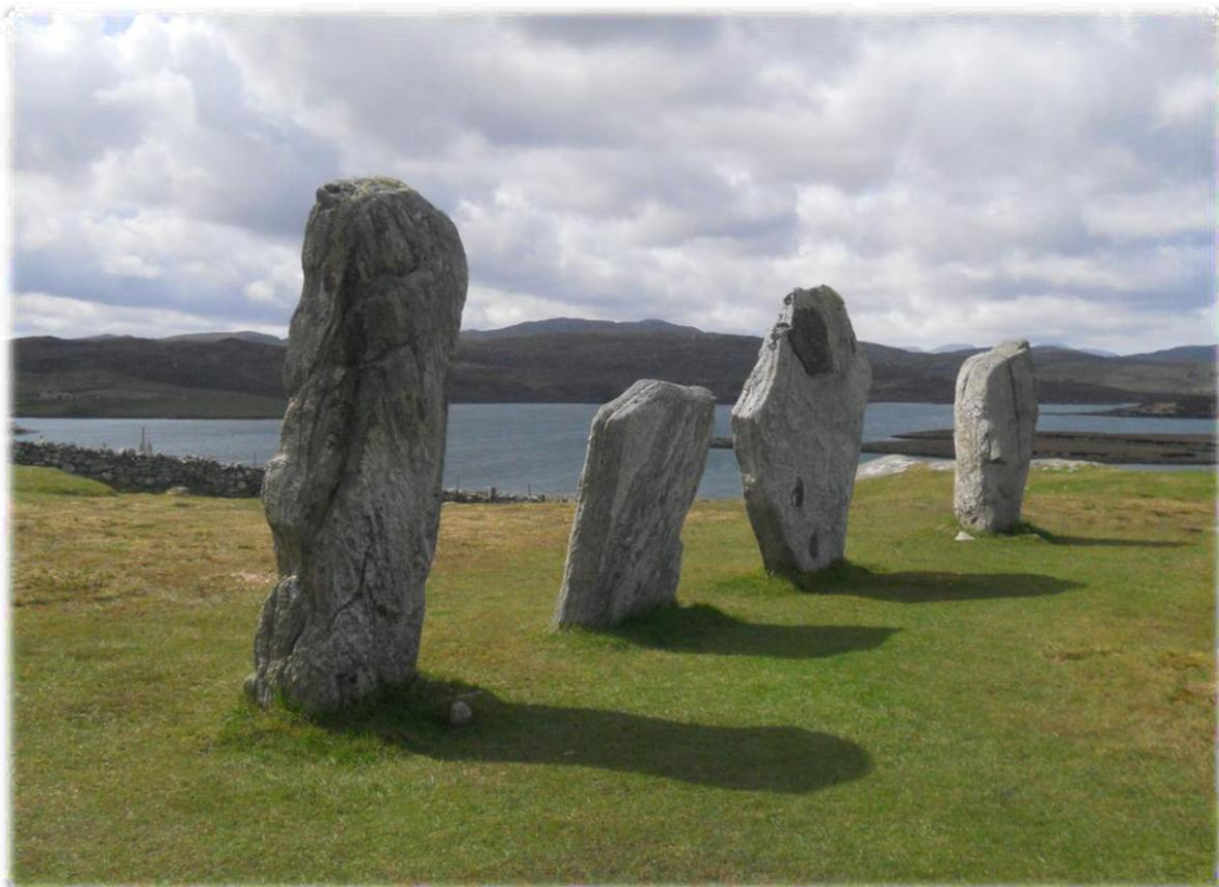
Callanish Stone Circle on the west coast of Lewis